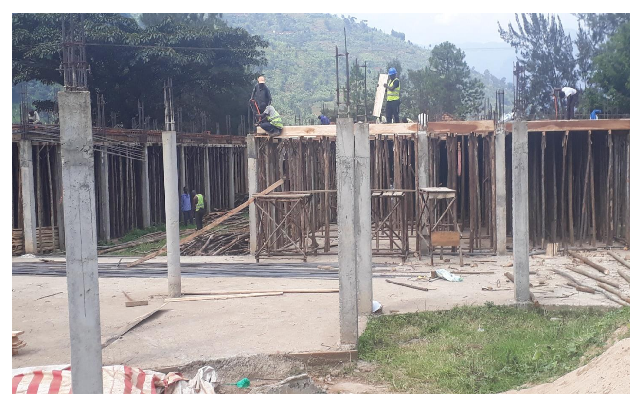
Figure 1: Construction of Administration Block Phase 3 ongoing