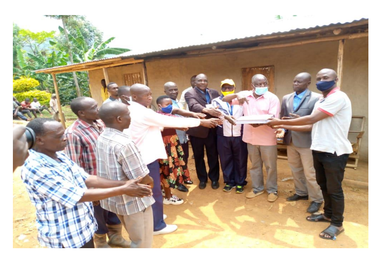
RDC and District Chairperson at the Bungolo GFS Official Launch in Bunabutiti sub county

In bid to improve hygiene and sanitation in rural growth centres, the district constructed 5 composite Pit latrines at the rural growth centres of Namunyu in, Nalufutuin Bukigai Sub County, Bubungi in Bunabutiti County, Khakale in Nabweya Sub County and Nanyele in Bududa Sub County in Financial year 2021-22.